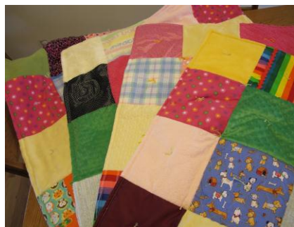
Four of our blankets.

These blankets will be used by the staff of these three agencies in working with their infant clients. We also donated some of our soft balls and taggies to these agencies.